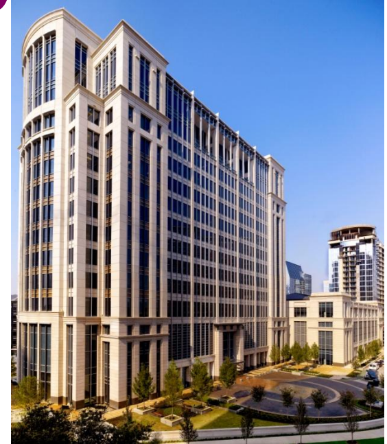
BOMA 360 Performance Building Rosewood Court, Dallas, Texas Managed by Stream Realty Partners, L.P.